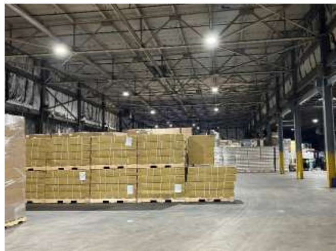
Storage facility in Harrison, NJ